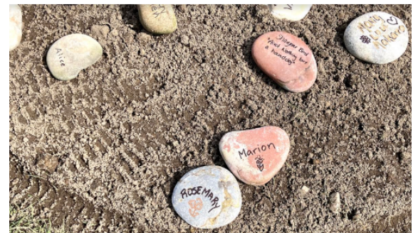
Names were prayed from our hearts and written on stones laid at the base of a memorial tree.