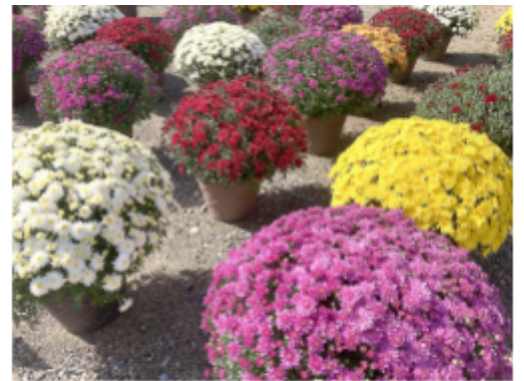
A sure sign of fall - mums at Tuttles! Enough money was raised to pay for five new statues for Paw Paw Memorial Park!