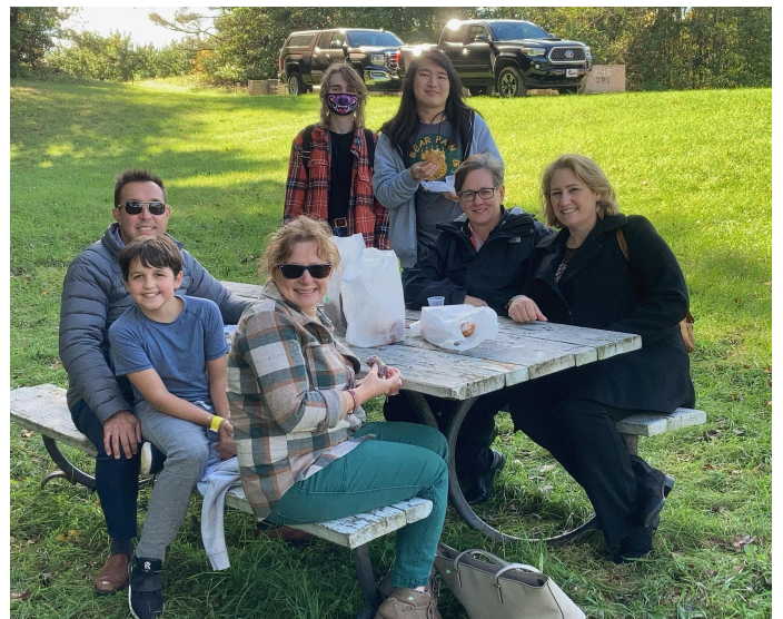
New friends get to know our church family on a lovely fall afternoon at Verhage Cider Mill.