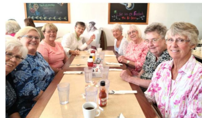
Brunch bunch welcomes Flat John Calvin