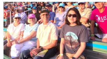
Church outing to Growlers game.