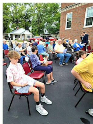
Nice crowd at the Sept 18 outdoor service.