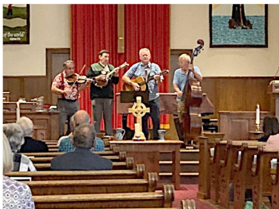
Sleepy Hollow String Band in Sanctuary Sept 11 when outdoor service was scrubbed due to weather.