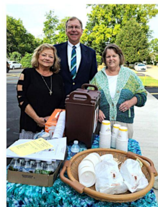
The Boltens served Bigby coffee. So thoughtful.