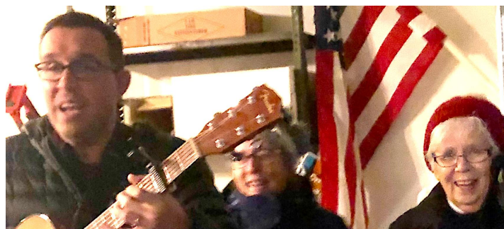
Church Caroling around town Dec 18