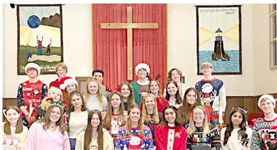
Paw Paw High School Choirs