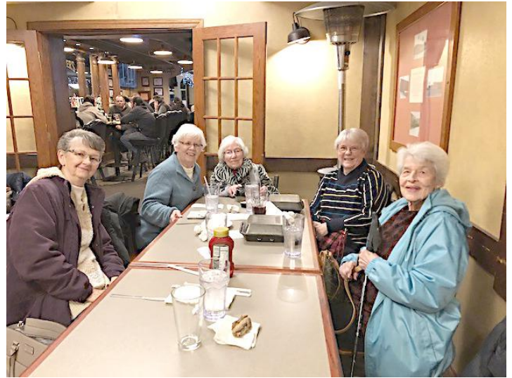
A lovely evening of food and fellowship took place on January 24, 2023 at Brewsters when the Single Ladies group stepped out.

About 150 people attended the Feb. 11 Wings of God fundraiser breakfast. Chuck Williams