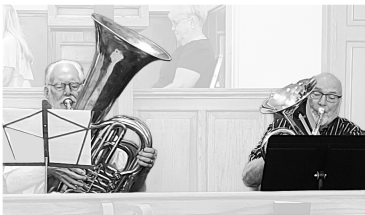
Additional musicians at our June 4 Worship. We thank you guys!

There will be light refreshments afterwards. This is a wonderful way to get to know each other better as we have embarked on a yoked relationship together.