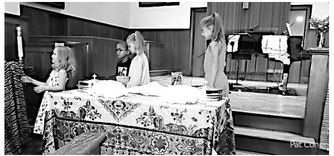
At the recent World Communion Sunday