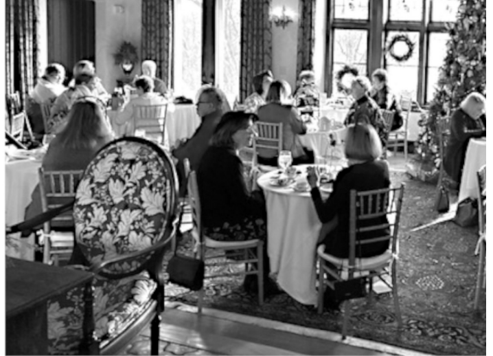
Presbyterian Women enjoying High Tea at Kellogg Manor on Dec. 19.