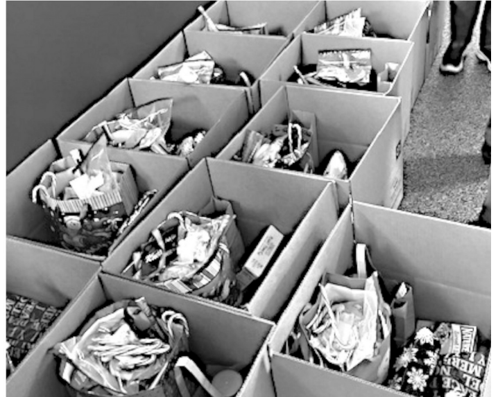
Christmas packages to Kalamazoo Probation Enhancement Program for the men at the Red Arrow motel. Thanks go out to everyone for their contributions!